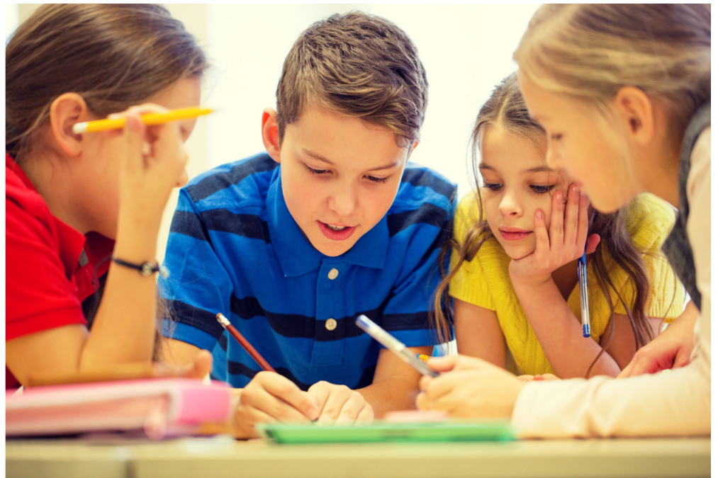
Cover image: Valley Vista Elementary School/Leveled Reading Classroom Libraries Grant

The Petaluma Education Foundation is 40! To celebrate this milestone and better serve our community, we're undergoing a comprehensive rebrand. Our goal is to empower all students to pursue creative and impactful academic careers. That's why we want to make our website even easier to navigate and modernize our logo with a fresh new look. Stay tuned for more updates as we continue to unveil our fabulous 40th makeover.