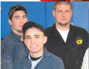
Title Sponsors of the 2011 Bash